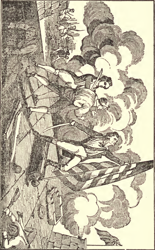
Jasper rescuing the colors---page 28.